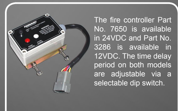
The fire controller Part No. 7650 is available in 24VDC and Part No. 3286 is available in 12VDC. The time delay period on both models are adjustable via a selectable dip switch.