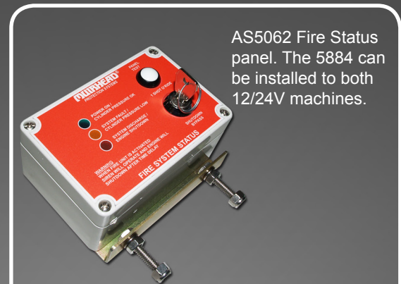
AS5062 Fire Status panel. The 5884 can be installed to both 12/24V machines.